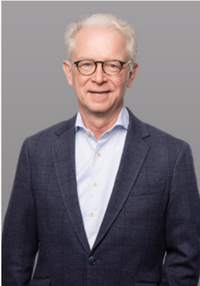
Chairman Supervisory Board Wienerberger AG