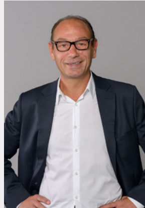
Chairman of the Group Works Council Wienerberger AG

We will continue to inform all our employees about the contents of the wienerberger Code of Conduct on an ongoing basis and also communicate its principles via various communication tools and through specific training. We would like to encourage all our employees and business partners to report potential violations or breaches of our Code of Conduct! Please report any reasonable suspicion of illegal activities or violations immediately as a witness. If you have any concerns or questions about how to proceed in a specific situation, we encourage you to raise them immediately at any time. We offer all employees several options for reporting, raising questions, or expressing their concerns either in writing or orally. Of course, you may also contact your supervisor at any time. If this is deemed inappropriate, you may make a report through an external, neutral whistleblowing service to communicate your concerns or questions.